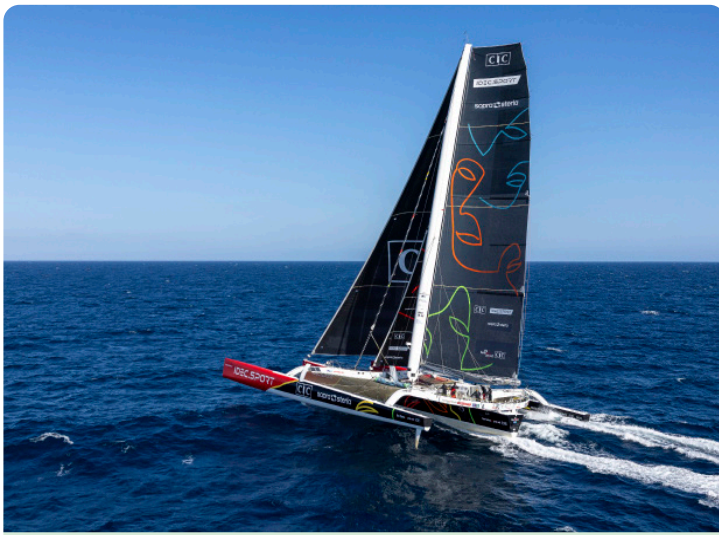
The Famous Project CIC maxi trimaran

co-skipper and senior crew on cutting-edge offshore projects- including record attempts and most recently a large multihull campaign - I completed my seventh circumnavigation, where the team became the first all-female team to sail non-stop around the world on a multihull in a time of 57 days.