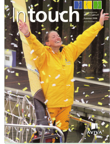
Issue 14 Summer 2006

at the highest level had historically seen little female representation. Rather than limiting my ambitions, this environment fuelled my resolve. It reinforced my determination to measure myself not against expectations, but against the highest performance standards the sport demands.