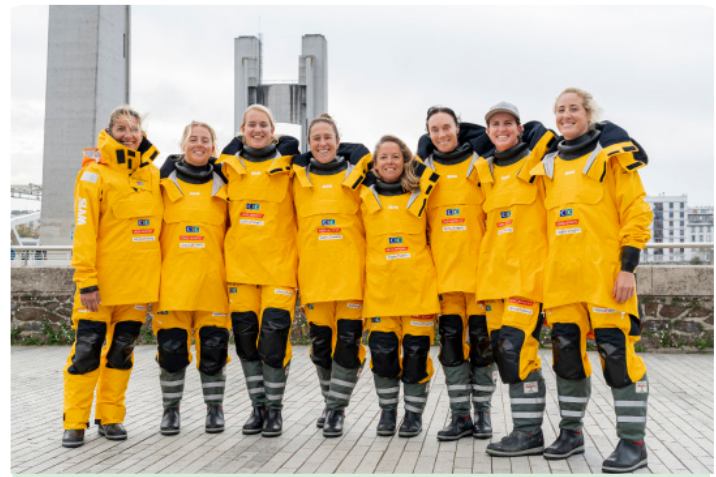
The all female crew

Looking back to the Aviva Challenge, it is clear that my journey has been far from linear. Each phase of my career - crewed racing, solo sailing, leadership roles and advocacy - has built upon the last. My development reflects a continuous process of learning, adaptation and growth, driven by curiosity and an unwavering commitment to improvement.