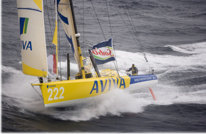
Vendee Globe 2008