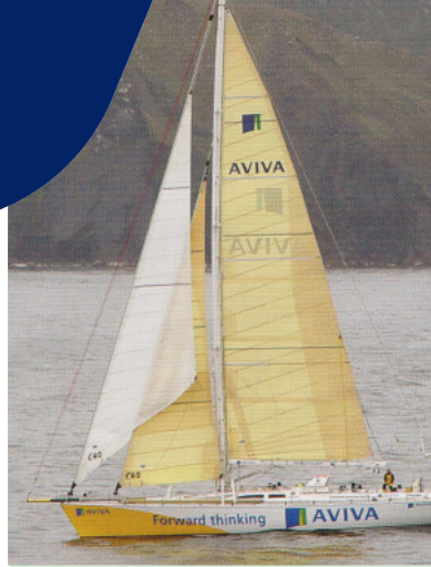
Aviva Challenge 2005/6

Equally significant was the context in which the Aviva Challenge took place. Offshore sailing